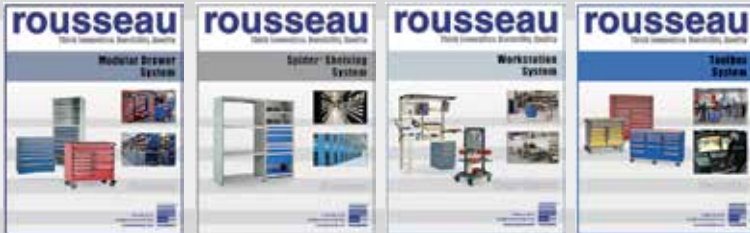
Modular Drawer System